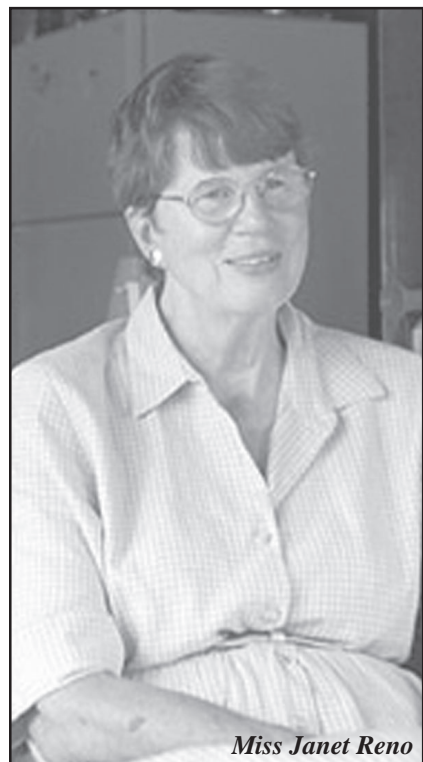
Miss Janet Reno

VIP and regular tickets as well as sponsorships for the event are available by calling the GLCCSF at 954.463.9005. Nomination forms for any of the awards are available at the center, on their website www.glccsf.org , or nominations can be emailed to glccftl@aol.com .